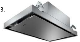
Neff Integrated Ceiling Extractor Hood