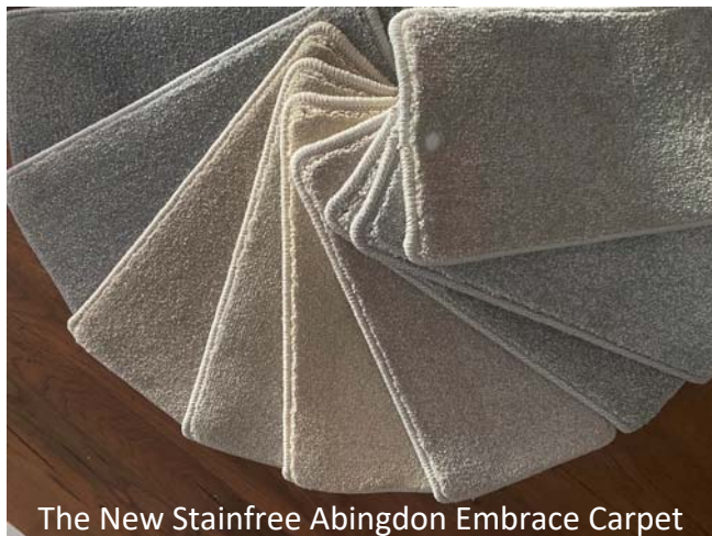
The New Stainfree Abingdon Embrace Carpet

A mix of colours can be chosen at an additional cost.