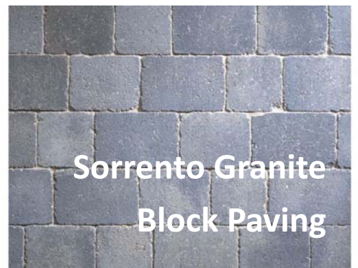
Sorrento Granite Block Paving