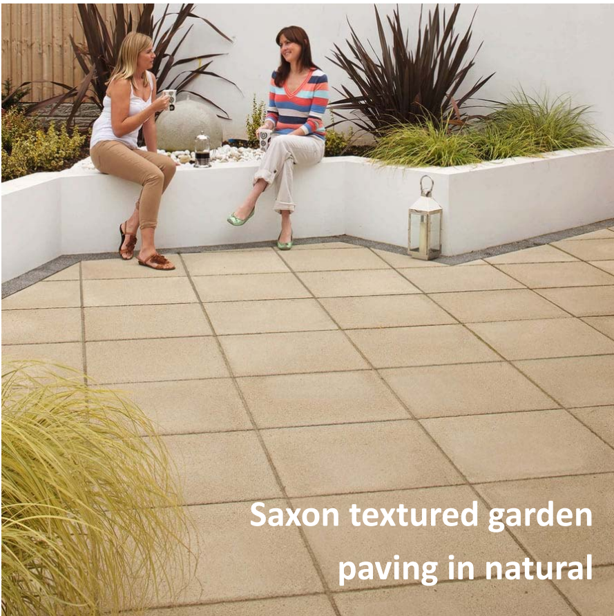
Saxon textured garden paving in natural