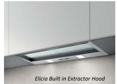
Elicia Built in Extractor Hood