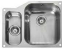
UB3515 Stainless steel 1.5 bowl undermount sink. Minimum base unit size: 600mm. Order Code: 814 04 LHD (left hand drainer) 814 05 RHD (right hand drainer)

Stainless steel 1.5 undermount sink unit. Upgrade available.